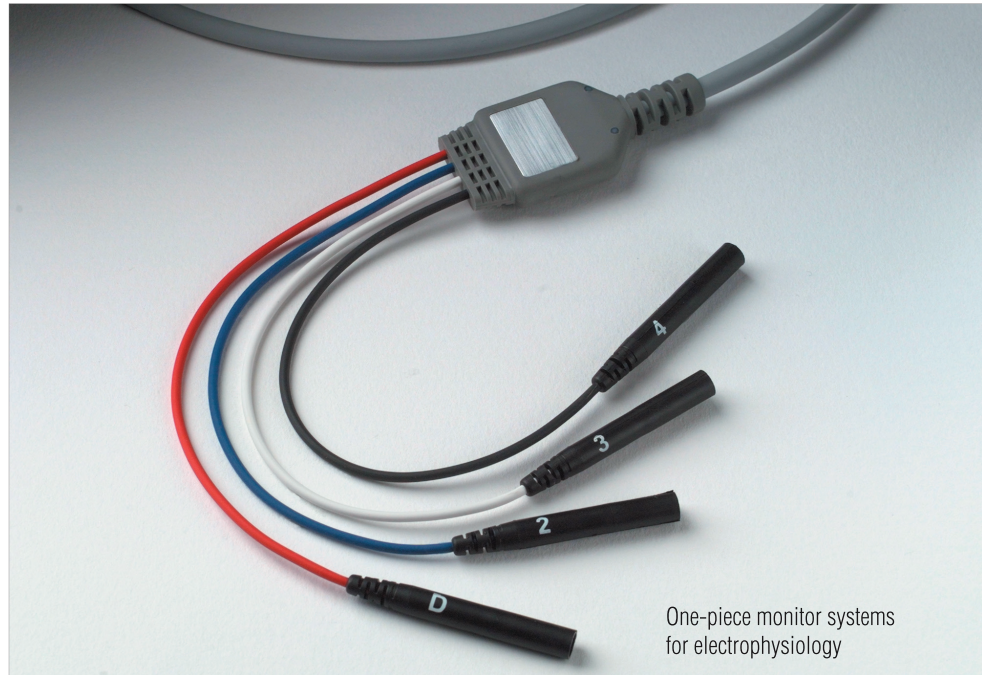
One-piece monitor systems for electrophysiology

For ablation systems, Slimline-EP Trunk Cables with Lead Wires comply with applicable portions of ANSI/AAMI HF-18 1993 for Electro-surgical Devices.